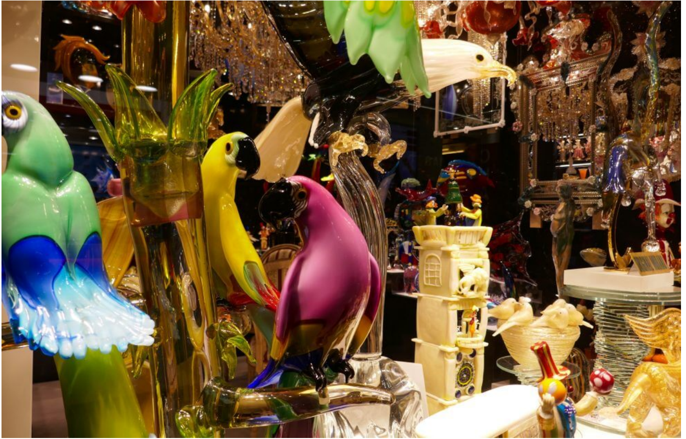
Not sure where you would put some of this stuff