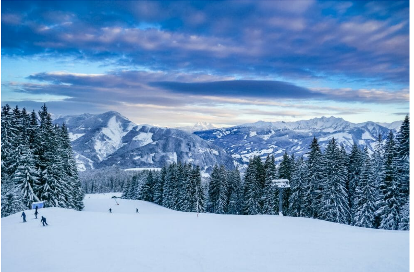
Last run of the day