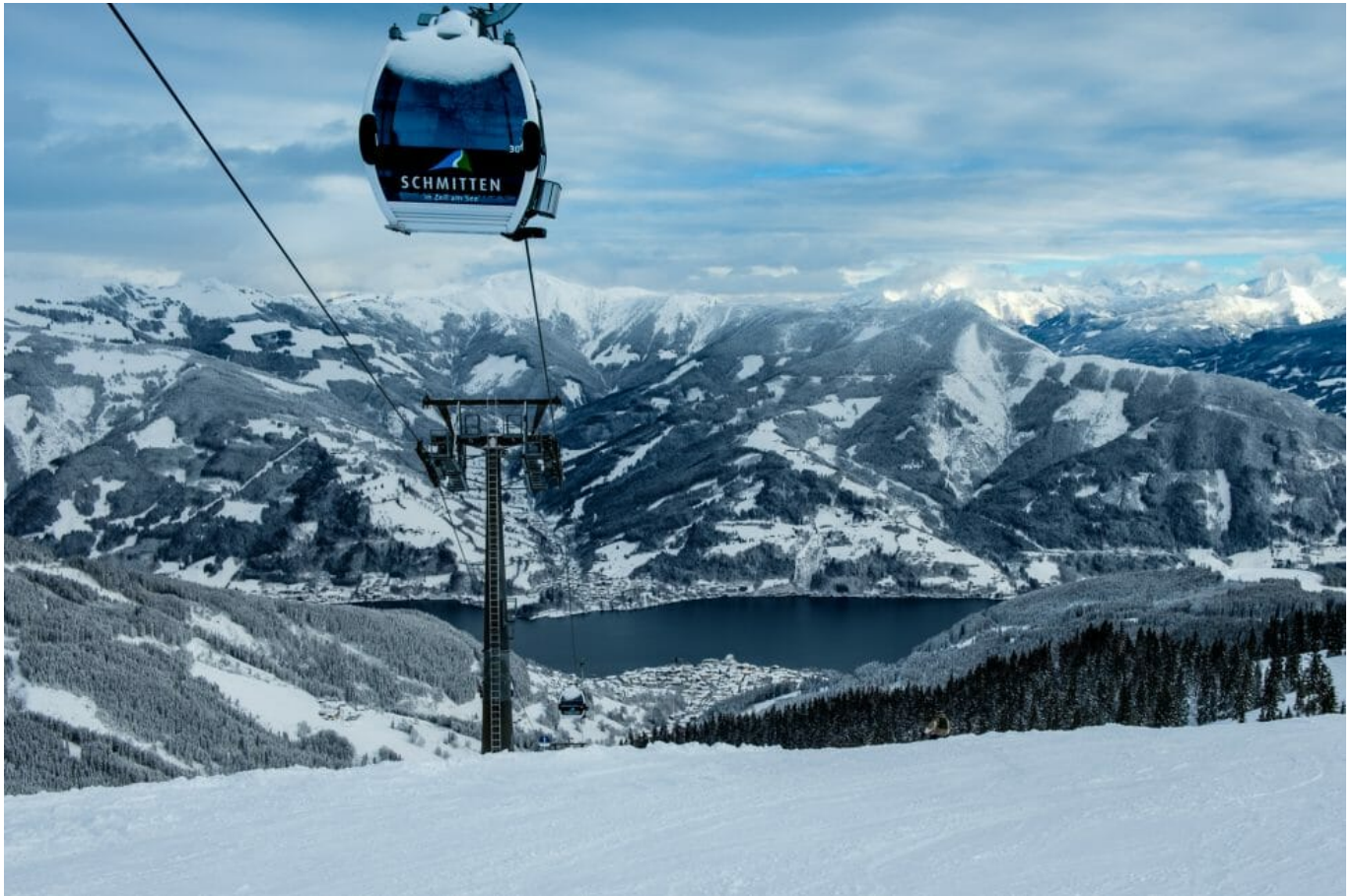
View back down to Zell am See

More runs opened up as the day progressed and we were able to explore the back side of the mountain. This is a great mountain for differing abilities as there is usually a harder way and an easier way on each run. Sometimes we would ski together but other times I would take the cruisy option. Matt ditched me near the end of the day to explore a different way down the mountain. I did the usual runs down the middle at a very slow pace, I just kept stopping to take photos as it was so incredibly beautiful.