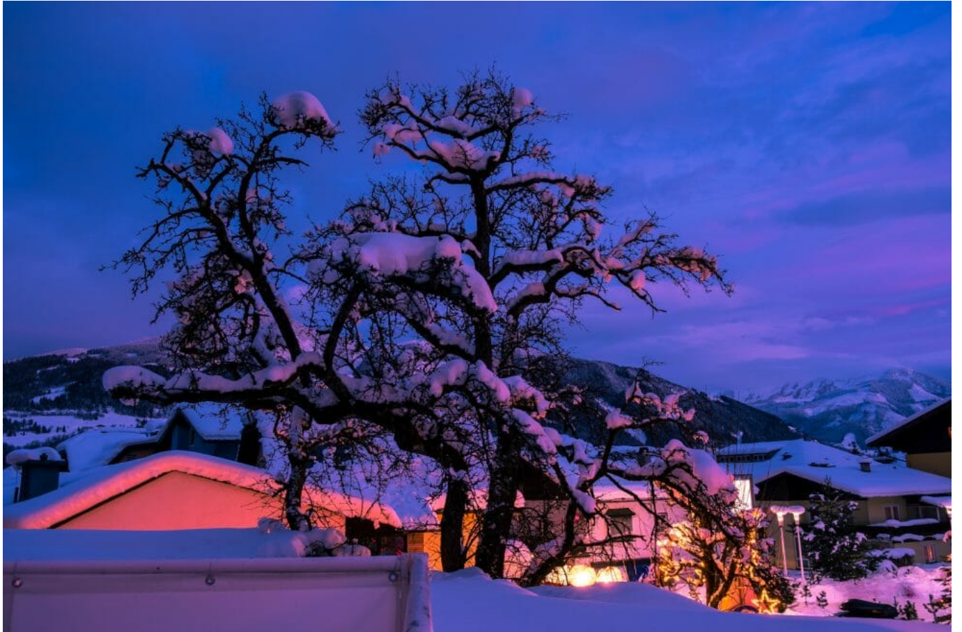
View from the other side of the apartment