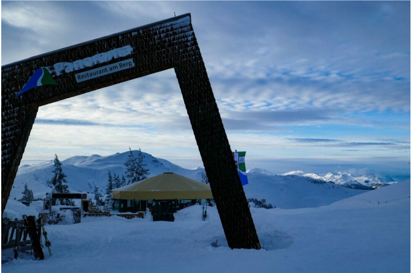
Our lunch spot