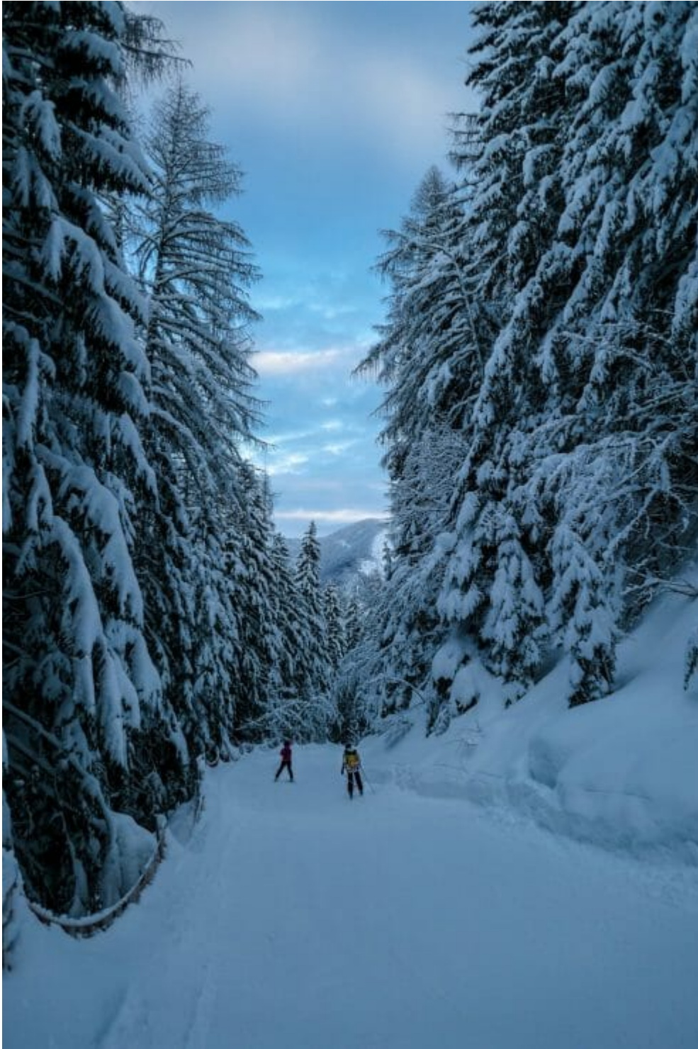
Cruisy Forest Trails