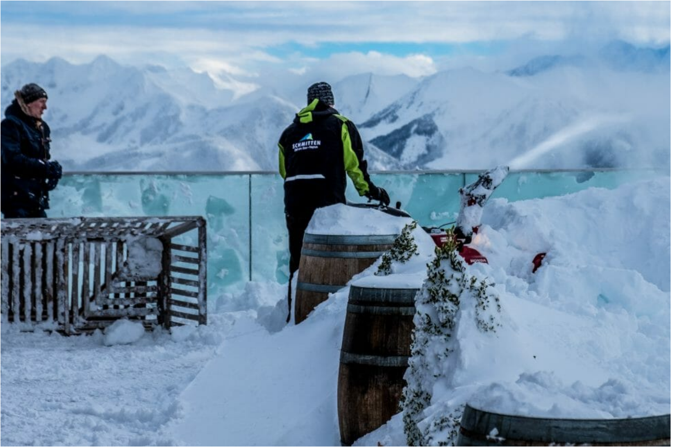
Clearing the decks on the restaurant balcony