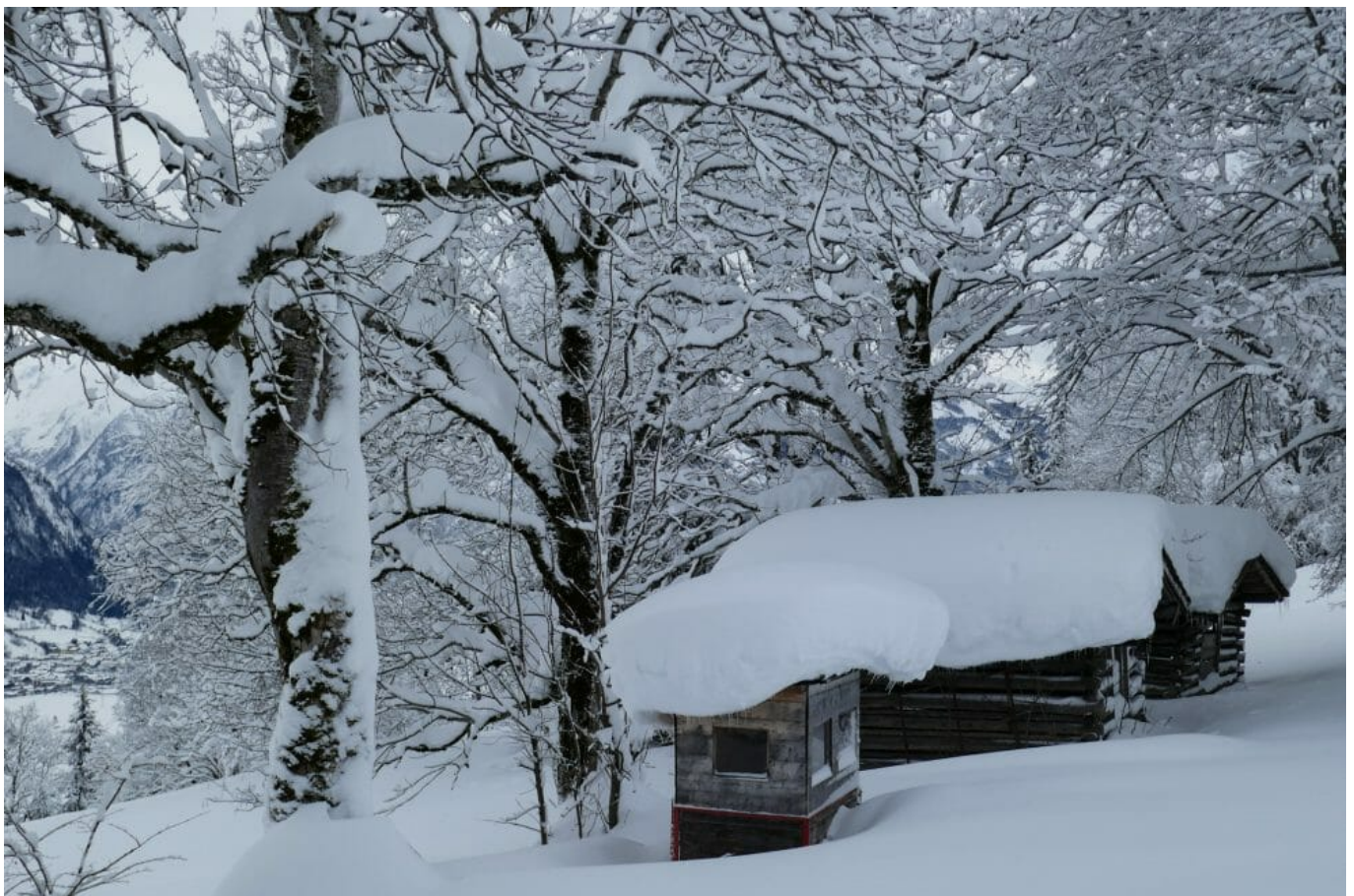
So much snow