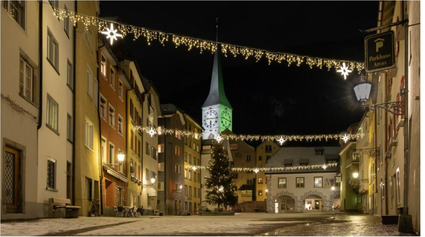
Chur Altstadt - The Old Town