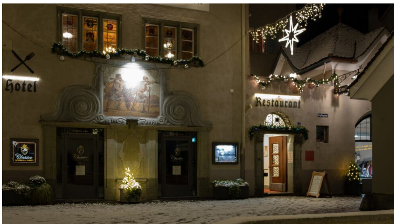
Hotel Zunfthaus Zur Rebleuten

Our hotel is a gorgeous 16th century Swiss Inn. It's not flash, but very comfortable and totally authentic. Finding an affordable dinner was a challenge tonight. I'd found one restaurant that looked really good and was reasonably priced (for Switzerland anyway), but I hadn't booked as we had no idea of timing. We tracked it down but they had no space, I guess everyone else thought it was a good option too. We wandered round the gorgeous old town for ages in the snow, looking at menus but not finding anything suitable. In the end we went back to the hotel and I checked the notes on my laptop. That gave us a couple of ideas and we found a restaurant that wouldn't bankrupt us. It was a Tex-Mex restaurant, but had a few local dishes as well. I was the only one who ordered a traditional meal from the Grisons, although I had my doubts about the added corn chips being local cuisine.