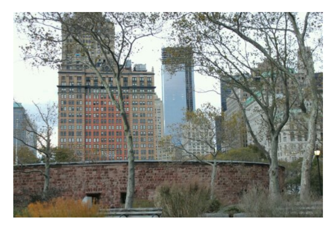
Battery Park – A bit battered about []