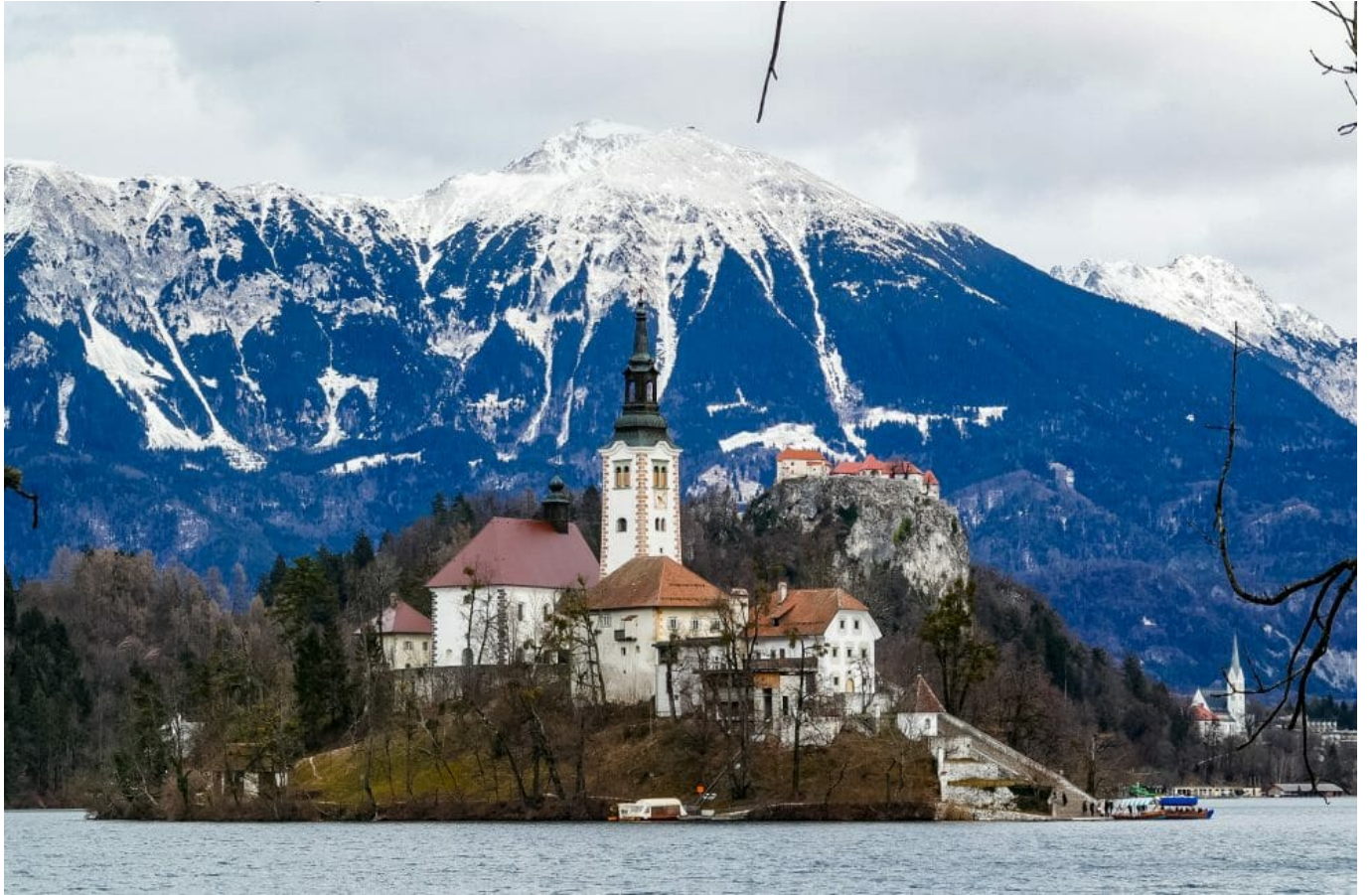
Lake Bled in the morning