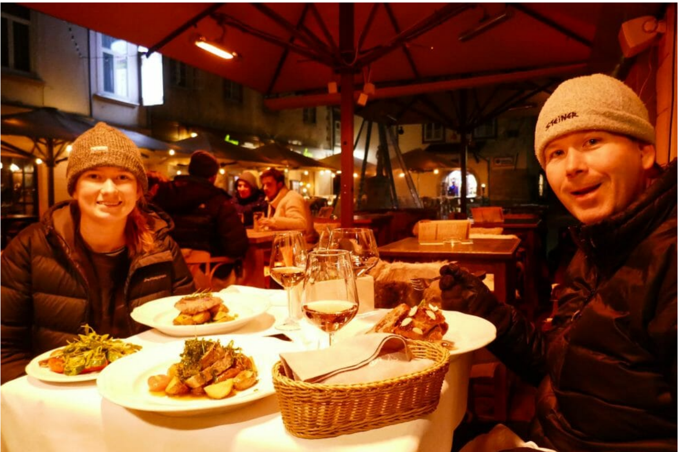
Outdoor dining in sub-zero temps