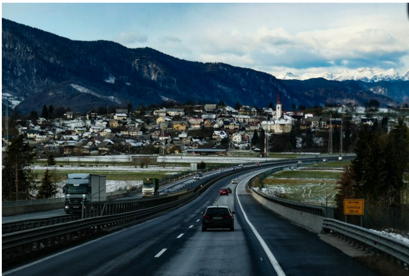
Enroute to Lake Bled

With the sudden change in plans, I hadn't had time to research where I was actually going, so just headed towards the island at the other end of the lake. Part way down I met an old Slovenian guy on a bicycle who had enough English to tell me the best viewpoints. He directed me to a viewpoint up a steep hill. Apparently a photo taken at that spot had won a National Geographic competition for the most beautiful place in the world. The signage was slightly confusing, but I'm pretty sure I ended up in the right place. It was a spectacular view anyway, and I didn't have to share it with a single soul.