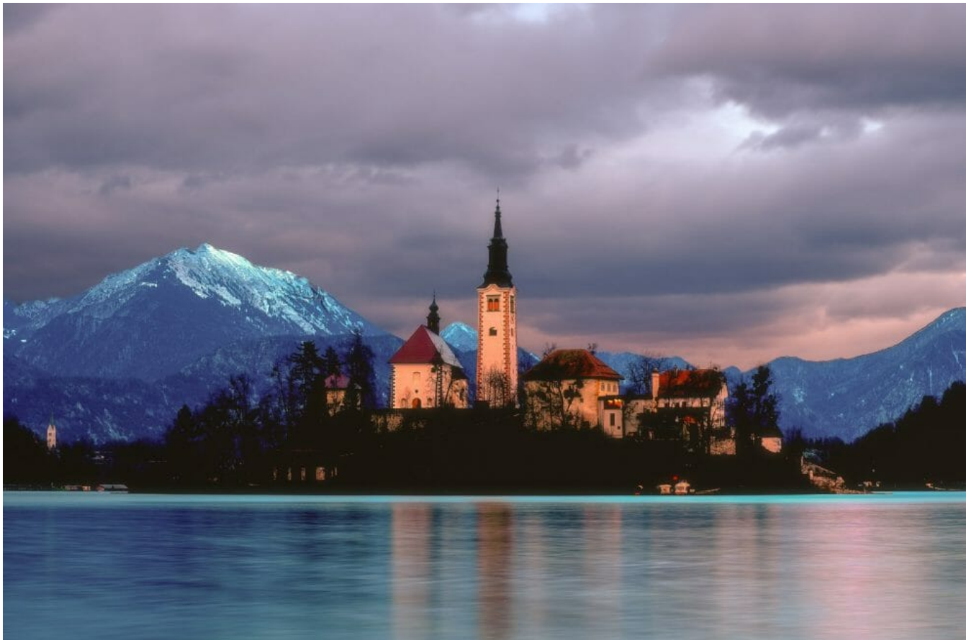
Just before sunset

sunset views and much better photos than me! They were back at the apartment by 7pm. Matt was already asleep so we went to a local restaurant for a last Slovenian dinner. Dining outside is huge in Ljubljana so we wrapped up warm and joined the locals. It was magic to sit outside at one of the riverside restaurants and enjoy beautiful food and Slovenian wine.