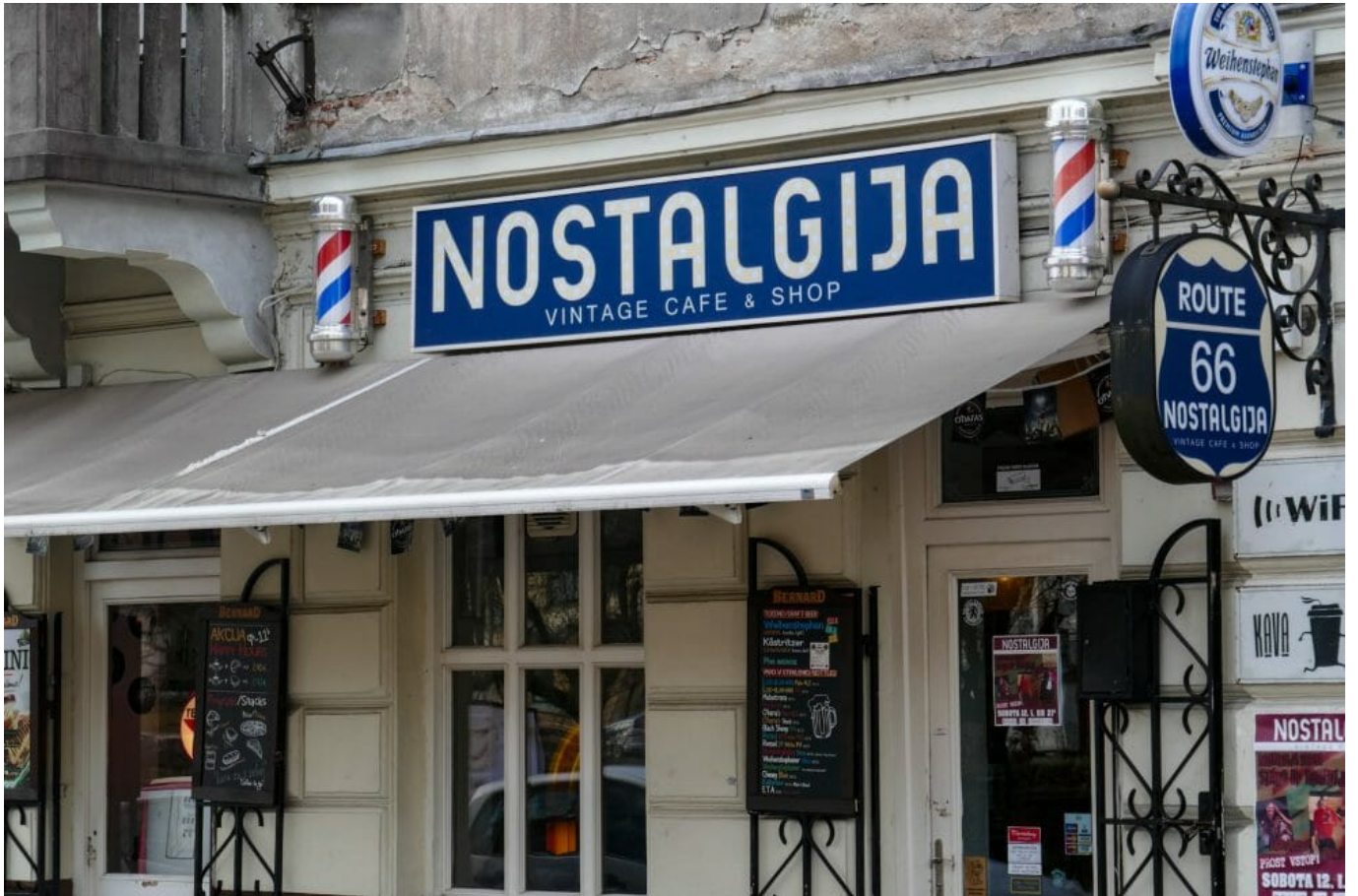
Didn't expect to find a Route 66 cafe here