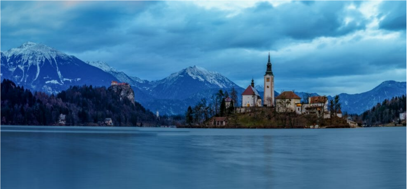
And after sunset