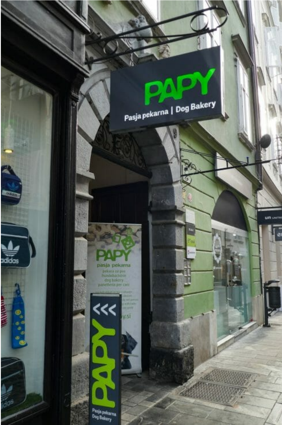
Doggies are so much part of life in Europe