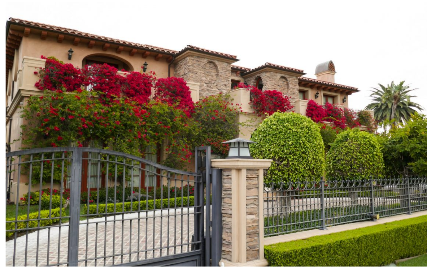
We quite liked this one