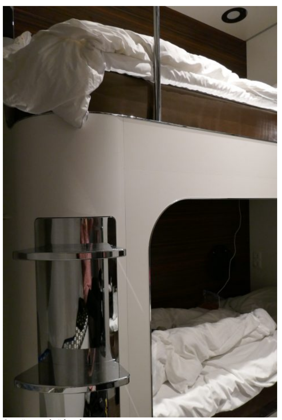
Our "capsule" bunks

Our first Danish dinner was a weird mix of 7-Eleven and supermarket food ...pizza, yakitori, blueberries and chocolate. We're so excited about exploring Copenhagen tomorrow.