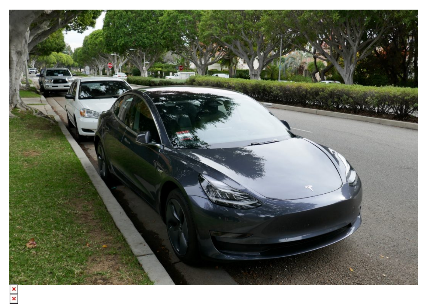
So many of these F150s around

We walked back to the hotel in time to grab our luggage and meet our shuttle to the airport. Our long haul flights are on four different airlines and today's sector was with SwissAir. It was fun listening to the announcements in four different languages and so exciting to finally be heading back to Europe.