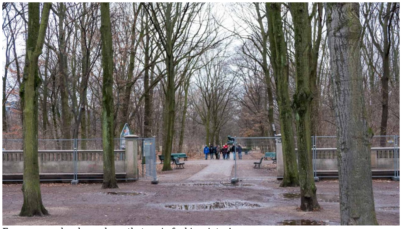
European parks always have that eerie feel in winter!