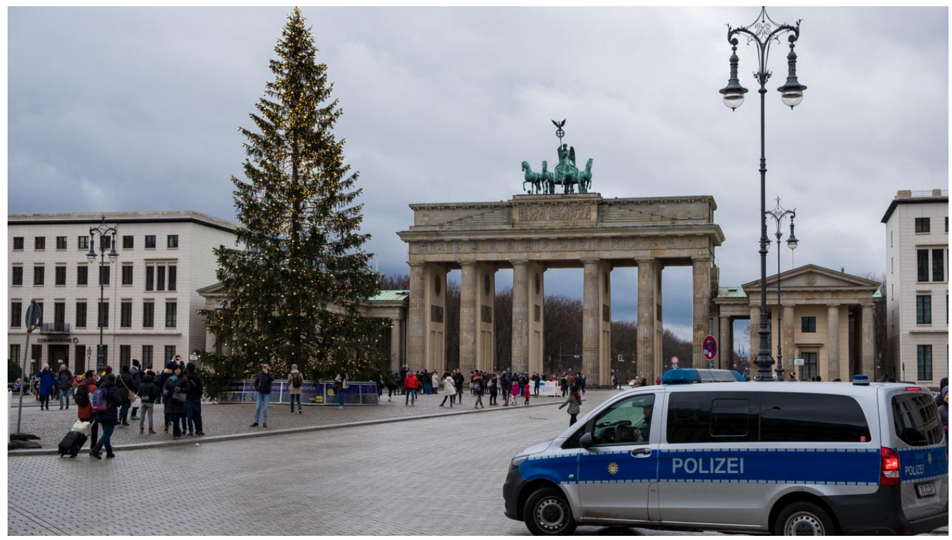
First stop was the Brandenburg gate. This was followed up by brunch of traditional Berlin Currywurst. Currywurst is steamed and fried pork sausages cut into small pieces. And this bit is especially for the rest of my family – then there is the sweet curry ketchup and a

Very much looking forward to joining up with the rest of the family tomorrow! Extremely fortunate to have a wife who supports my mad excursions like this one.