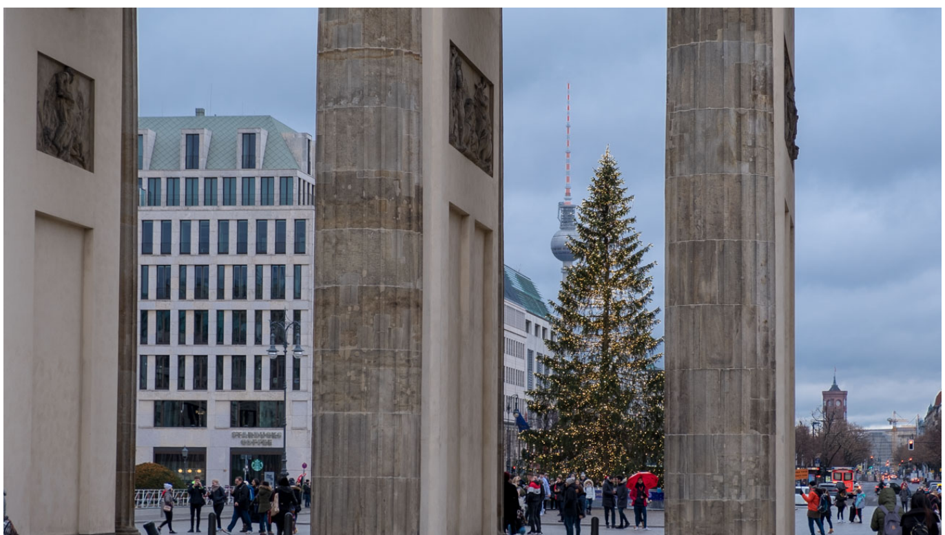
There's that TV tower again!

sprinkle of curry spice for that special flavor and appeal.