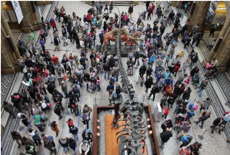
Queues in the dinosaur gallery